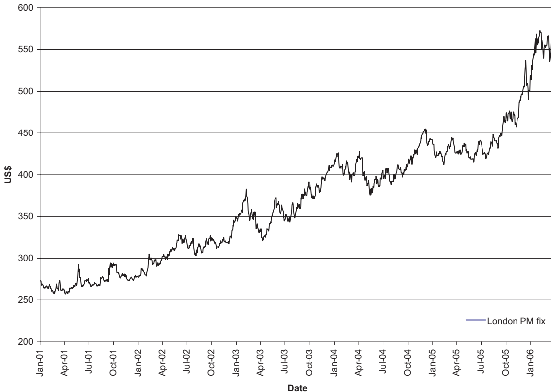
Daily gold price, January 1st 2001 to March 31st 2006

The following chart provides historical background on the price of gold. The chart illustrates movements in the price of gold in US dollars per ounce over the period from January 1, 2001 to March 31, 2006, and is based on the London PM Fix.