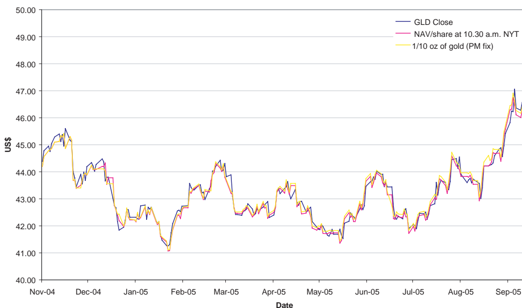
Share & Gold Price v. NAV from fund inception to September 30, 2005

Investing in the Shares does not insulate the investor from certain risks, including price volatility. The following table illustrates the movement in the price of the Shares against the corresponding gold price (per 1/10 of an oz. of gold):